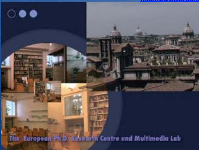
The European Ph.D. Research Centre and Multimedia Lab