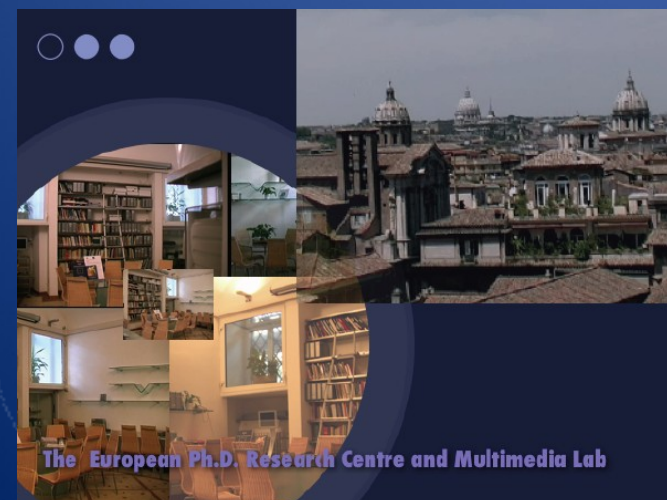
The European Ph.D. Research Centre and Multimedia Lab